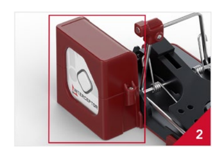
A customized housing securely attaches the indicator magnet to the trigger bar. The housing contains the Interceptor processor and magnetic reed switch.