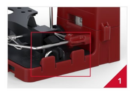
From the back of the housing, two easy-to-release connectors hold the snap trap in place but make it easy to remove for cleaning.