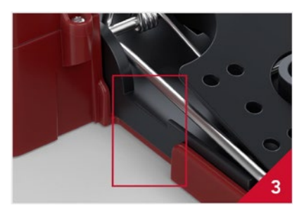
The base of the trap is designed with a space on each side to make it easy to utilize a zip tie to mount to pipes and other elevated rodent runways.

© 2021 ES OpCo USA LLC. All Rights Reserved. The Veseris mark, logo, and other identified trademarks are the property of ES OpCo USA LLC or its affiliates.